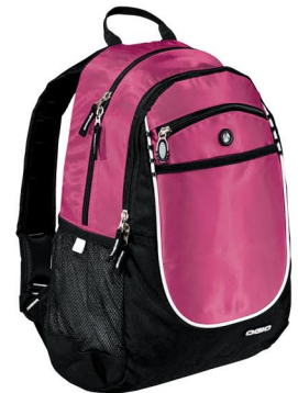
Shades of 674C